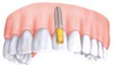
Crown centred on abutment

As treatment does vary so much between patients, we recommend you speak to a dentist.